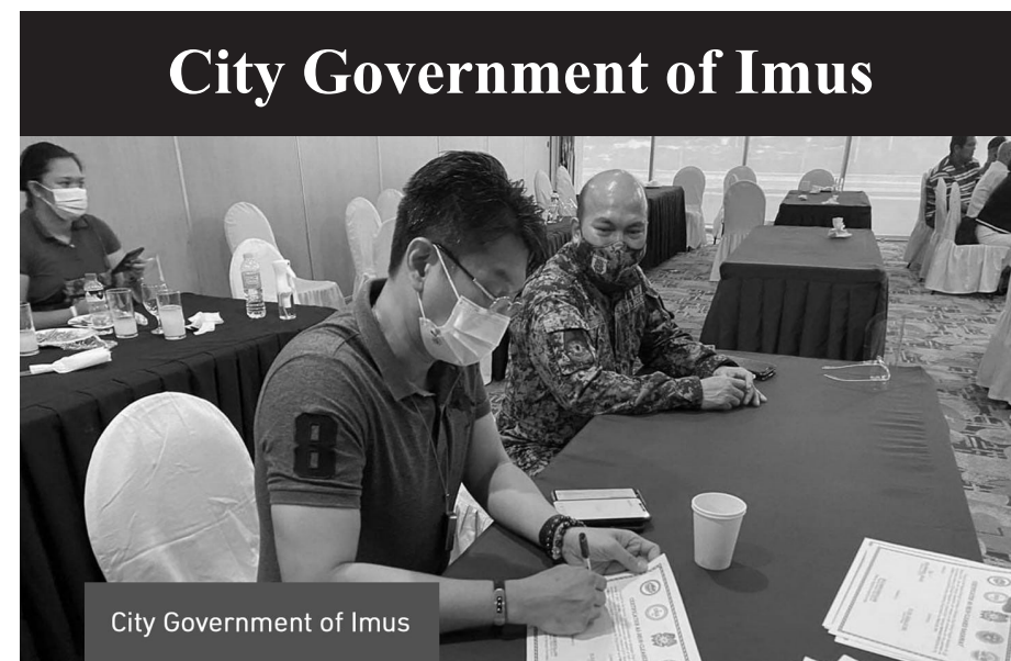
City Government of Imus

Ayon kay Cayetano, malaking hakbang ito para sa pagsusulong ng patas na karapatan at proteksyon ng mga OFWs. Gayunman naaprubahan ang Global Compact for Migration sa United Nations noong 2018. Ito ang kauna-unahang United Nations Global Agreement na tutugon sa iba't ibang pangangailangan at karapatan ng mga migrante sa buong mundo.