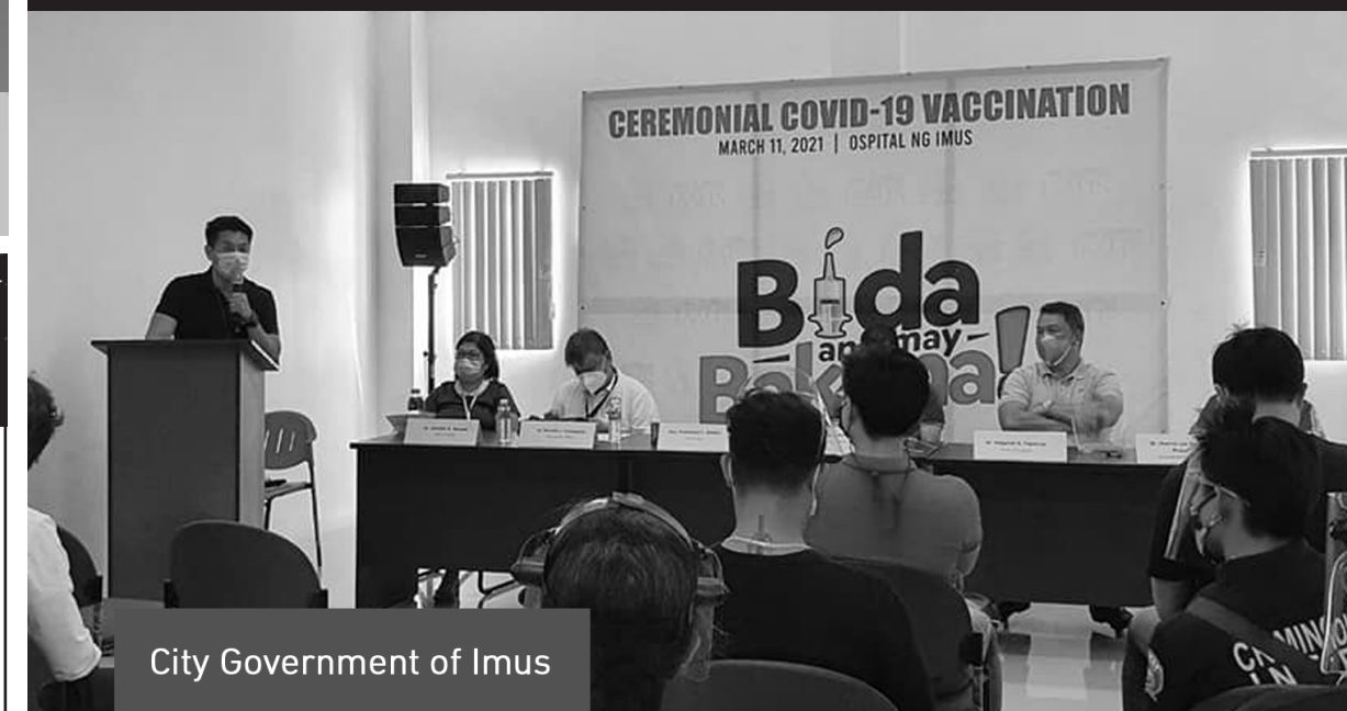
City Government of Imus