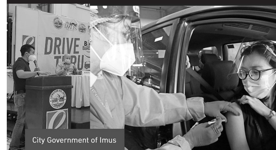
City Government of Imus